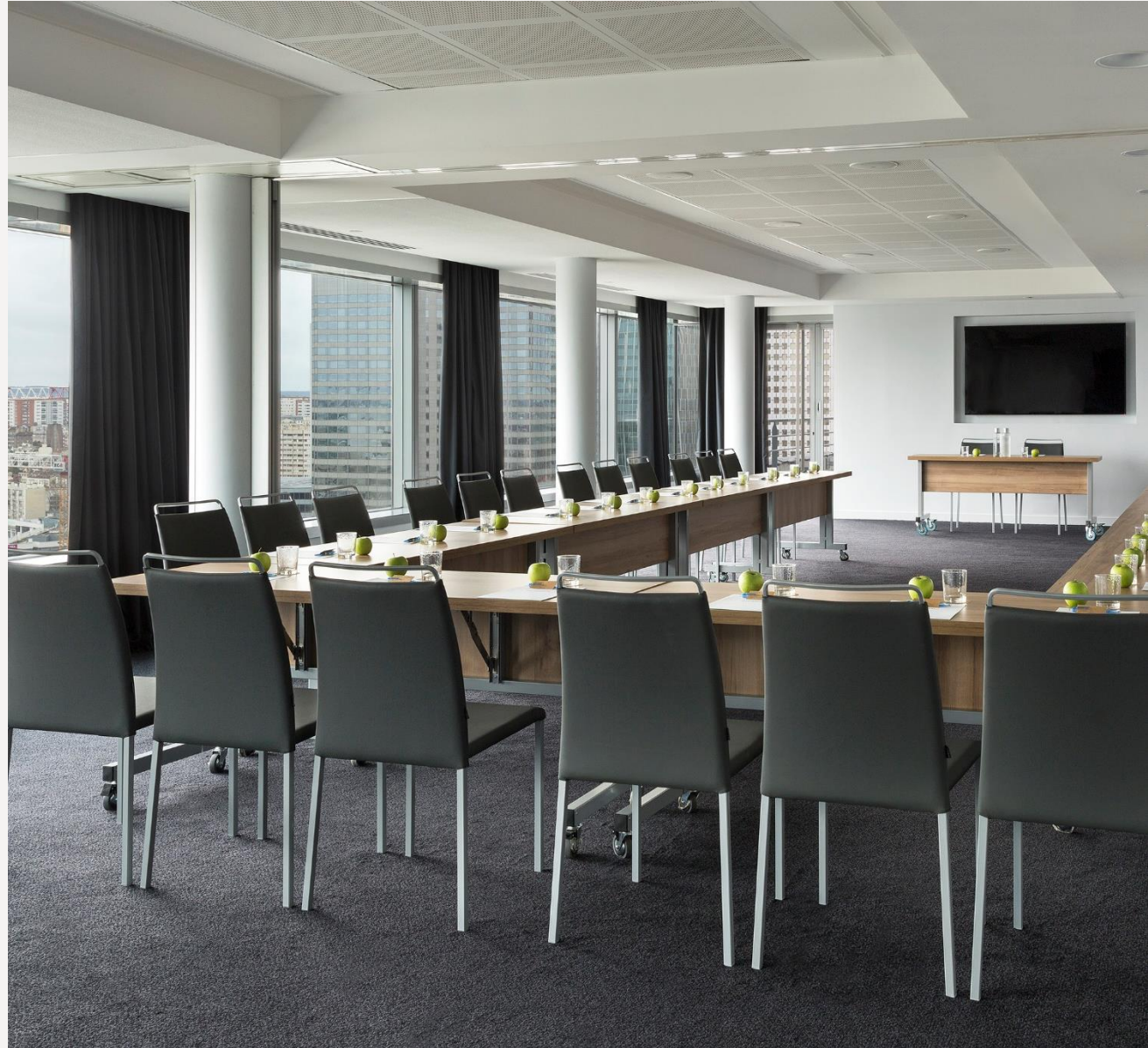
Eiffel I,II meeting room

As part of its ecological commitment, Meliá Paris La Défense has launched the "Road to Net Zero" program, which evaluates and offsets the carbon footprint of your events to make them carbon-neutral. 🌱