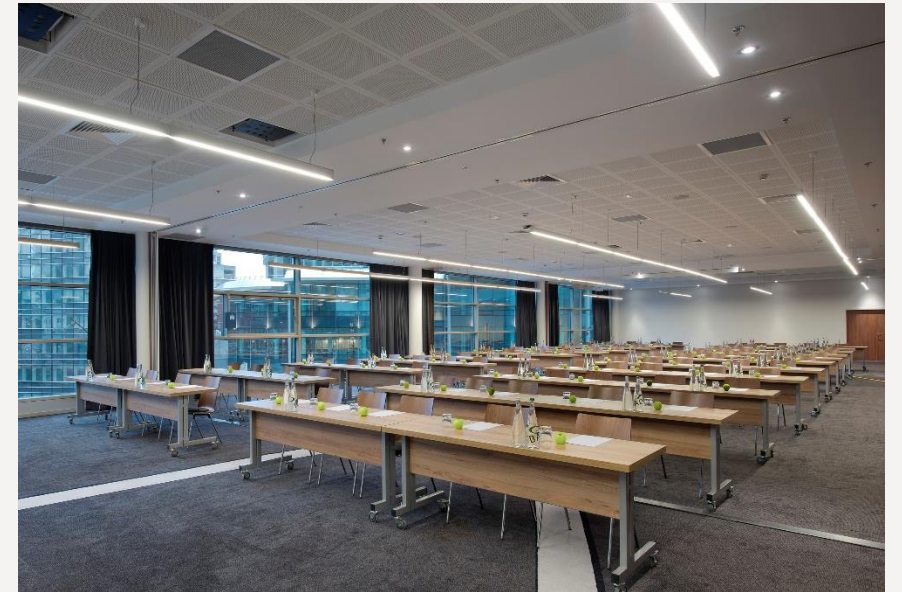
Miro I,II,III meeting room