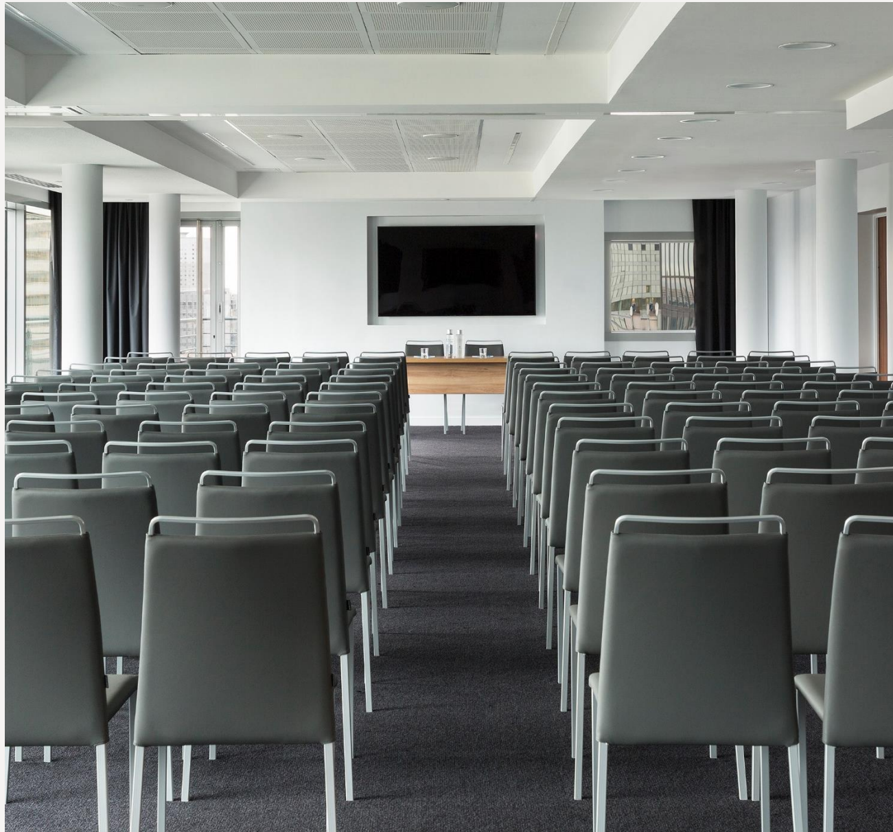
Eiffel II meeting room