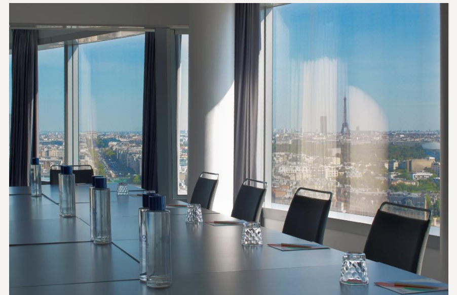
Flexi meeting room